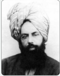
Hazrat Mirza Ghulam Ahmad – The Promised Messiah and Mahdi (peace be upon him)