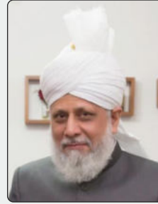
Hazrat Mirza Masroor Ahmad – Head of the worldwide Ahmadiyya Muslim Community

The Ahmadiyya Muslim community was founded in 1889 by Hazrat Mirza Ghulam Ahmad (1835-1908) of Qadian, India. He claimed to be the expected reformer of the latter days and the awaited one of the world's religions (the Messiah and Mahdi of the latter days). His mission was to revive the peaceful teachings of Islam and engender in people's hearts the love of God and the duty to serve mankind.