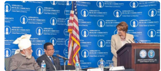
Nancy Pelosi – Speaker of the U.S. House of Representatives, welcoming His Holiness to Congress