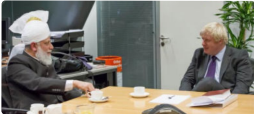
Rt Hon Boris Johnson MP – Former Prime Minister of the United Kingdom

His Holiness regularly meets presidents, prime ministers, other heads of state, parliamentarians and ambassadors of state. His Holiness has delivered keynote addresses in the UK Parliament, Capitol Hill, the European Parliament, the Dutch Parliament and New Zealand Parliament emphasising the need for absolute justice.