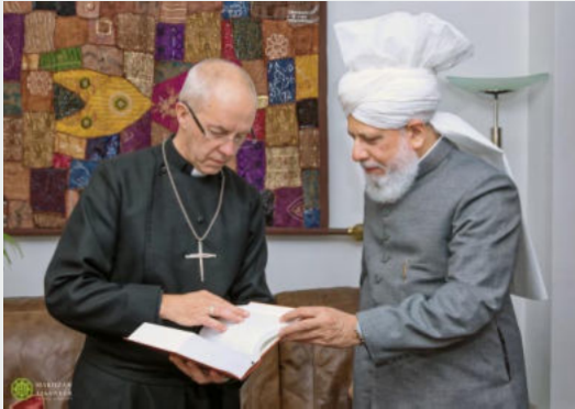
His Holiness presenting Justin Welby with a copy of the Holy Qur'an.

(Golden Principles of Justice and Peace)