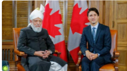
Rt Hon Justin Trudeau MP – Prime Minister of Canada