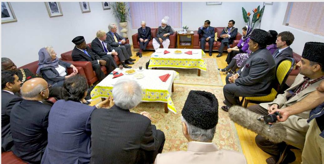
Private audience with Hadhrat Mirza Masroor Ahmad before start of symposium.