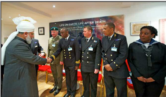
Members of the army and navy meeting the Khalifa.