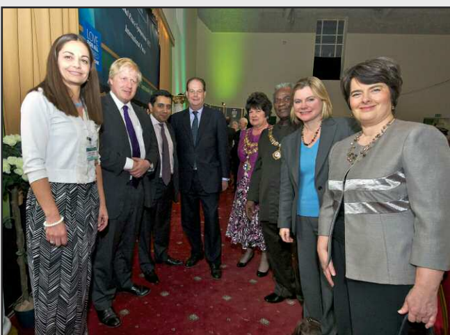
Some of the guests that attended:(from left to right)