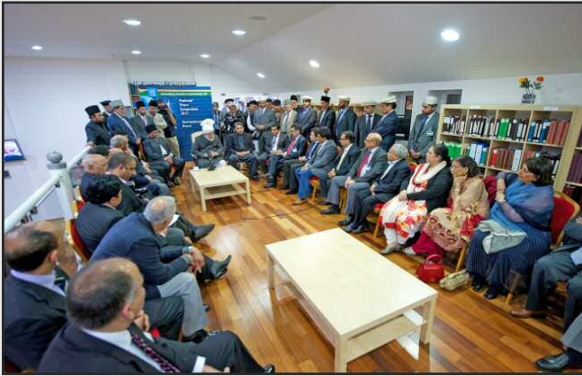
Members of the Urdu speaking media meeting the Khalifa.