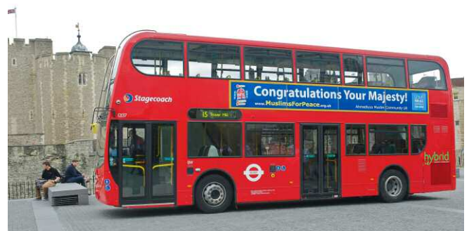
Message of congratulations featured on the London buses

charities – particularly with a charity walk in May at the Tower of London (and this evening I have extended a special invitation to our mayor, Boris Johnson) – and we will partake in the celebrations by illuminating our mosques and inviting neighbours to share the occasion with us. We will also wear our hearts on our sleeves, and you will see nearer the time messages of congratulation to the Queen on our buses.