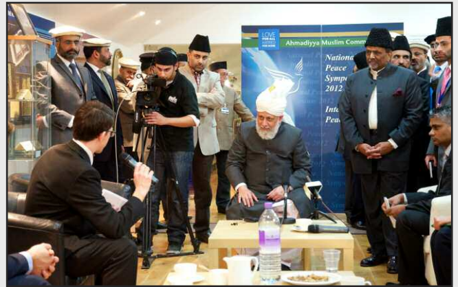
Members of the English media meeting the Khalifa after the symposium.