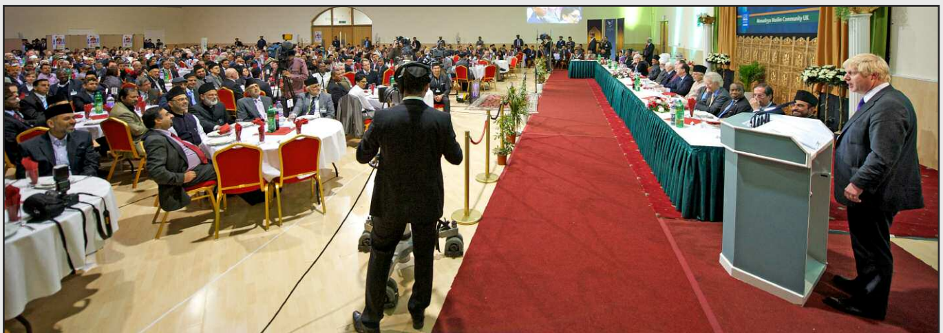
London Mayor Boris Johnson addressing the audience.