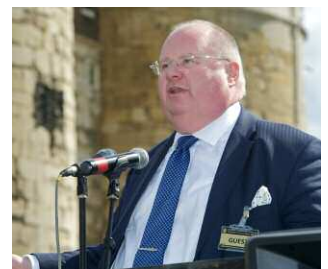
Rt Hon Eric Pickles MP – Secretary of State for Communities and Local Government

‘Your Holiness, it has rarely been more important for communities to come together in the search for peaceful co-existence, tolerance and equality. Appropriately the theme for your annual Peace Symposium on the 24th of March this year is International Peace. I am delighted to send you the following message for your event.