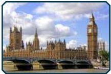
House of Commons, UK Parliament, London