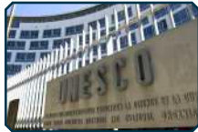
UNESCO, Paris, France