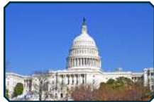
Capitol Hill, Washington, USA