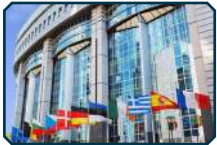
European Parliament, Brussels, Belgium