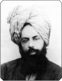
Hazrat Mirza Ghulam Ahmad The Promised Messiah and Mahdi (peace be upon him)

The Ahmadiyya Muslim community was founded in 1889 by Hazrat Mirza Ghulam Ahmad (1835-1908) of Qadian, India. He claimed to be the expected reformer of the latter days and the awaited one of the world's religions (the Messiah and Mahdi of the latter days). His mission was to revive the peaceful teachings of Islam and engender in people's hearts the love of God and the duty to serve mankind.