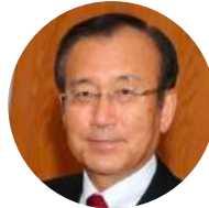
Dr Tadatoshi Akiba Awarded for his work to press for the abolition of nuclear weapons.