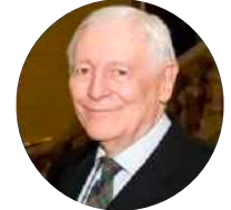
Lord Eric Avebury Awarded for his service for peace, with a particular focus on human rights.