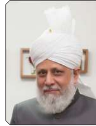
Hazrat Mirza Masroor Ahmad Head of the worldwide Ahmadiyya Muslim Community

“...a religion which does not inculcate universal compassion is no religion at all. Similarly, a human being without the faculty of compassion is no human at all.”