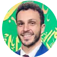
Nicolò Govoni (Italy) Awarded for his tireless dedication to human rights and the education of refugee children.