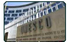
UNESCO, Paris, France