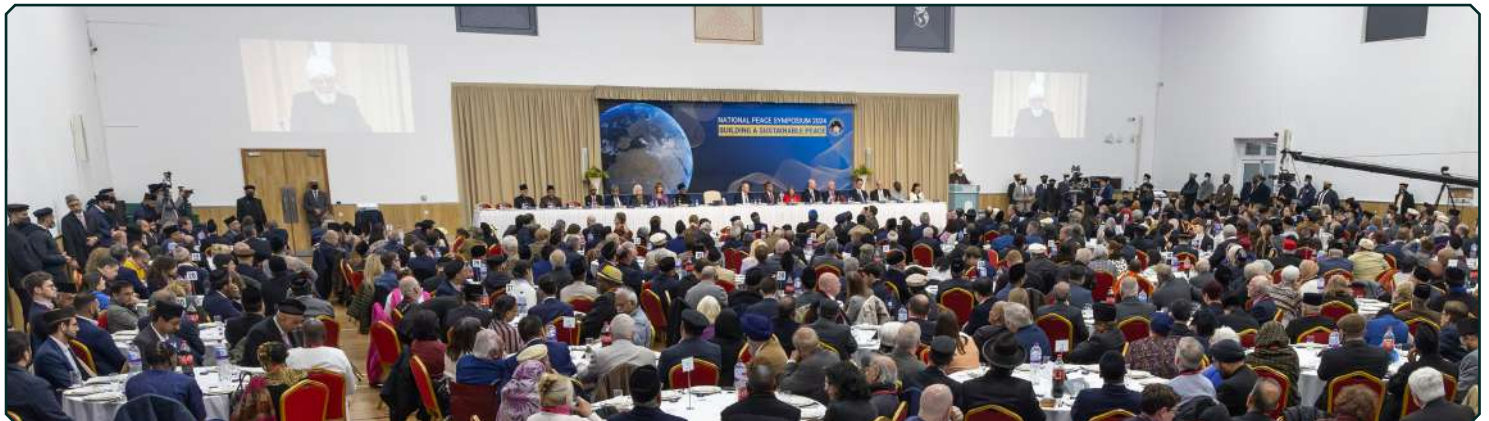
(The 18th National Peace Symposium held at the Baitul Futuh Mosque)

Recent events continue to highlight the perilous state of the world. Nationalism, self-interest and injustice are fuelling wars, poverty, inequality and are creating humanitarian crises across the globe. The threat of another full blown world war looms large. It is the need of the hour to unite for the cause of peace and strive together for the betterment of our current and future generations.