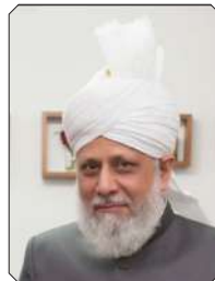
Hazrat Mirza Masroor Ahmad Head of the worldwide Ahmadiyya Muslim Community

“...a religion which does not inculcate universal compassion is no religion at all. Similarly, a human being without the faculty of compassion is no human at all.”