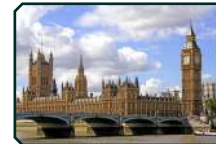
House of Commons, UK Parliament, London