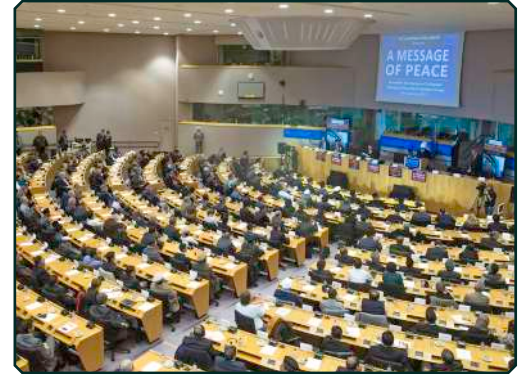
European Parliament, Brussels, Belgium

His message is rooted in the belief that lasting peace cannot be achieved through power or narrow self-interest, but through sincere service to humanity, the safeguarding of human dignity, and the consistent application of justice at every level of society.