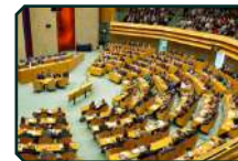
Dutch Parliament, The Hague, Netherlands