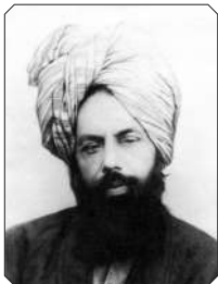
Hazrat Mirza Ghulam Ahmad The Promised Messiah and Mahdi (peace be upon him)

The Ahmadiyya Muslim community was founded in 1889 by Hazrat Mirza Ghulam Ahmad (1835-1908) of Qadian, India. He claimed to be the expected reformer of the latter days and the awaited one of the world's religions (the Messiah and Mahdi of the latter days). His mission was to revive the peaceful teachings of Islam and engender in people's hearts the love of God and the duty to serve mankind.