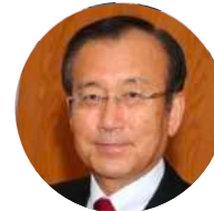
Dr Tadatoshi Akiba (Japan) Awarded for his work to press for the abolition of nuclear weapons.